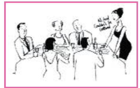
Couldn't be bothered