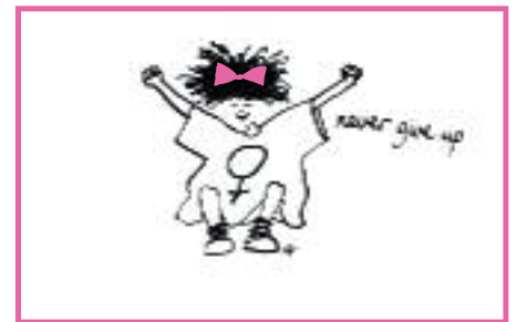
Never give up