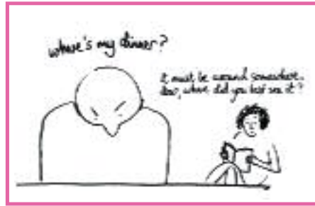
Where's my dinner