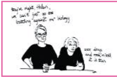
Rock 'n' roll