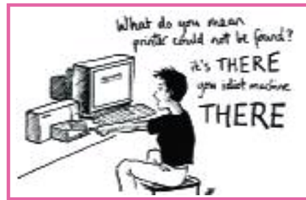
Communications revolution: No1