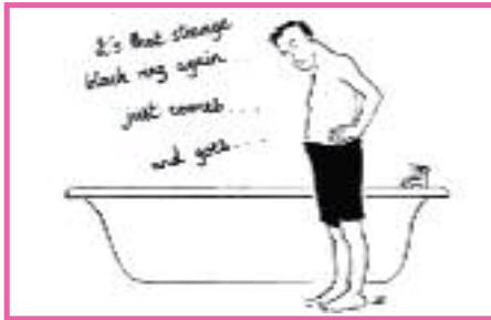
Strange black ring