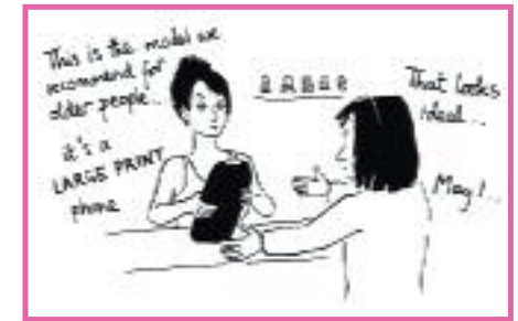
Large print phone*