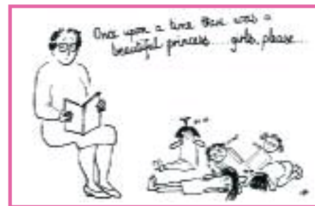
Once upon a time