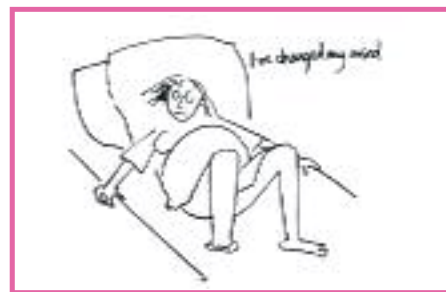
Changed my mind